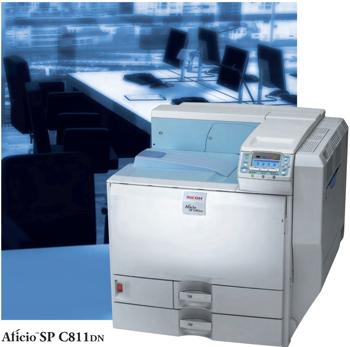
Aficio™ SP C811DN