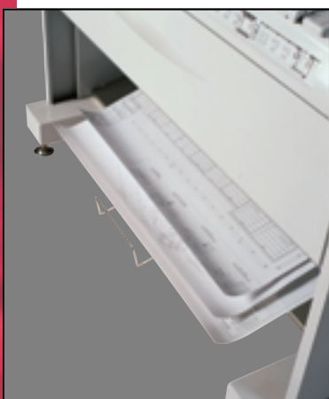
Optional multiple copy stacker