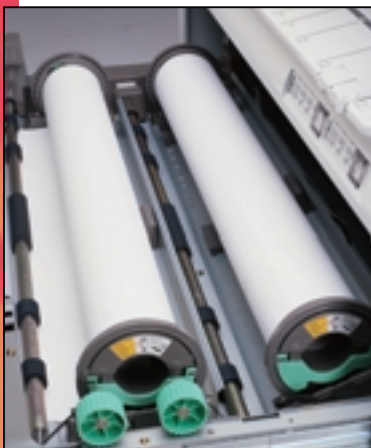
The optional second roll feeder