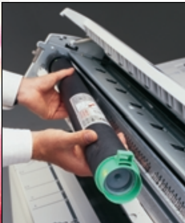
Easy to change toner cartridge